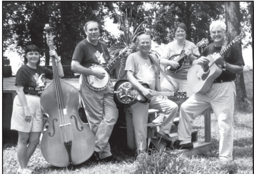
The Backroom Bluegrass Band from Crestwood Christian Church, Lexington, will entertain at Cane Ridge Day during the noontime picnic.

The Cane Ridge Bulletin Volume XLII, No. 2 Summer 2008